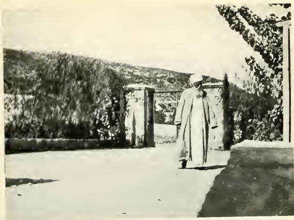
ABDUL BAHÁ ENTERING THE GARDEN OF HIS HOUSE IN HAIFA